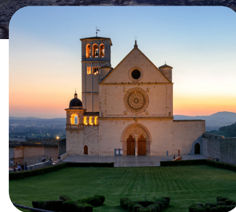
Basilica of St. Francis

home to the Miraculous Crucifix, and stroll through the shell-shaped Piazza del Campo, featuring the Palazzo Pubblico and Torre Del Mangia. Lastly, we'll view the relics of St. Catherine at the Basilica of St. Dominic before continuing to Florence for dinner and overnight.