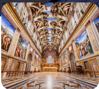
The Sistine Chapel